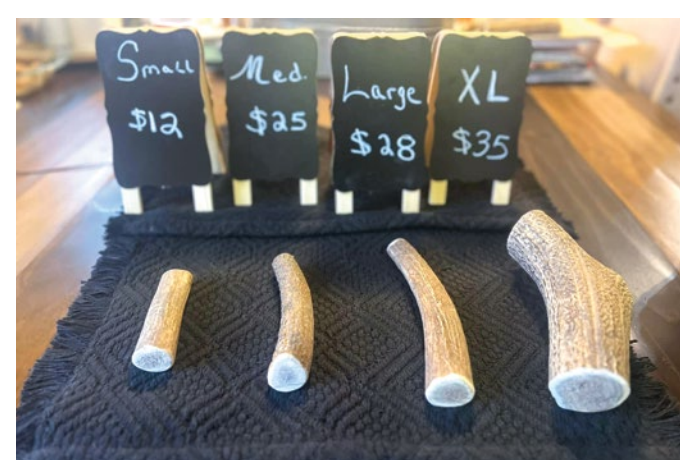
Border View Elk Chews offers long-lasting dog bones for aggressive chewers.

More information on Border View Elk Ranch can be found at www.borderviewelkranch.com. ■